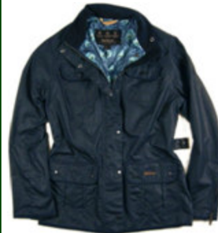
Navy with Liberty 'Peacock' Lining