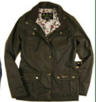
Olive with Liberty 'Mirabelle' Lining

Barbour Memory International Trench - Functional waterproof garment, Barbour's iconic trench coat style. Elasticated belt, and features Union Jack embroidery. Thermal lining for colder climates.