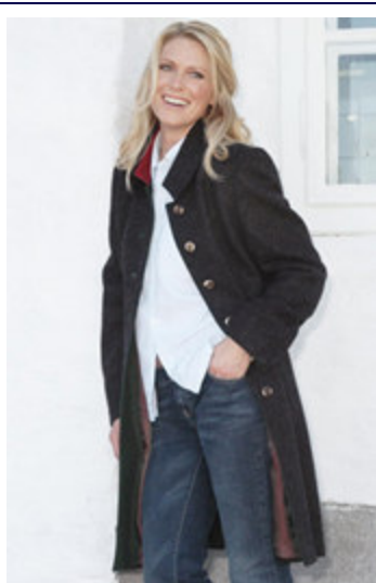
Salko 'Graz-K' Ladies Loden Coat - Slightly fitted knee length coat, handmade button holes and base collar in contrasting pattern. Dragoon style back with real stag horn buttons.