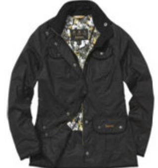
Black with Liberty 'Poppys' Lining