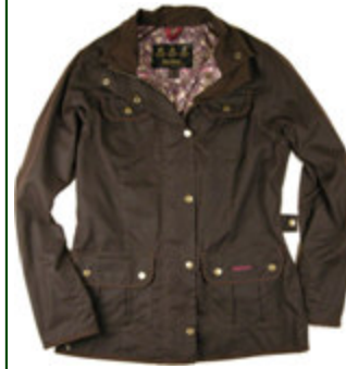
Rustic with Liberty 'Strawberry Thief' Lining

Barbour Kate Utility Jacket - The ever-popular Women's Utility is now available in four colors: navy, rustic brown, olive, and black, each sporting an authentic Liberty of London print interior. As this is a limited edition offering once our supply is exhausted there will be no more.