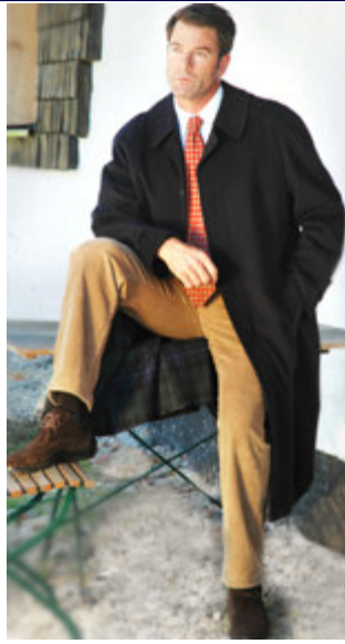
Salko 'Abado' Men's Loden Coat - Raglan coat with minted leather buttons, split removable plaid wool lining, and a zippered interior pocket.

SALKO of AUSTRIA - Loden is a water-repellent fabric consisting of 85% wool and 15% alpaca. The high quality loden materials used to make a Salko coat are breathable, soft and flowing, and water-repellent thereby guaranteeing the highest carefree wearing comfort. The authentic stag horn buttons with fabric protecting slanted edges are partially hand-sewn. Greatest importance is attached to the finishing of the traditional (tracht) elements, which are partially handmade with extraordinary effort. Handmade split piping buttonholes, edges and decorations in contrasting colors are typical elements of the "Austrian Style".